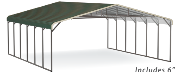
Includes 6" overhang on front & back