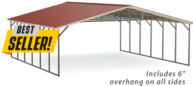
Includes 6" overhang on all sides